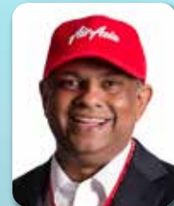
Tan Sri Dr. Tony Fernandes

Vice President Upstream Research RYSTAD Energy