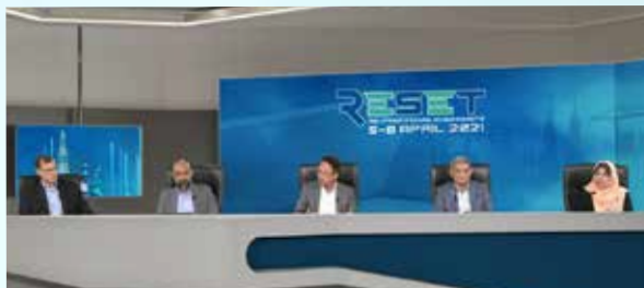
EXECUTIVE PANEL SESSION #1 Resetting the Upstream Operating Model in Malaysia

Global leaders from PETRONAS, PTT EXPLORATION AND PRODUCTION, PERTAMINA INTERNASIONAL EP, SERBA DINAMIK, EXXONMOBIL, RYSTAD ENERGY, and many more took part in RESET 2021. This virtual event provided insights about the major trends that will drive change and transformation within the oil and gas industry, setting a new dimension for the advanced technology effort.