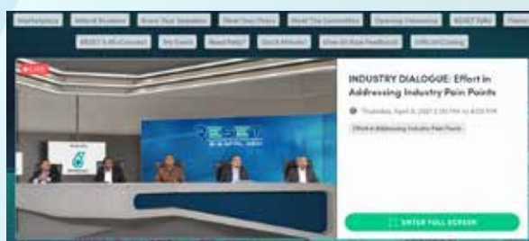
INDUSTRY DIALOGUE Efforts in Addressing Industry Pain Points