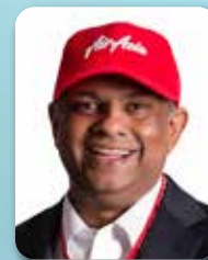
Tan Sri Dr. Tony Fernandes

Vice President Upstream Research RYSTAD Energy