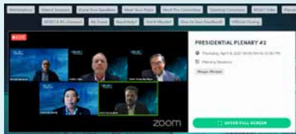
PRESIDENTIAL PLENARY #2 Thriving in the Lower for Longer Era