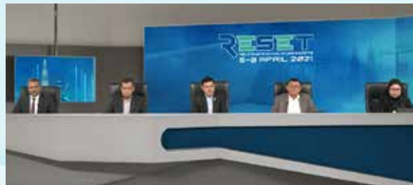
EXECUTIVE PANEL SESSION #2 Resetting The Scene (Transforming Mindset, Processes & Innovation)