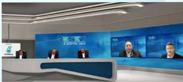
PRESIDENTIAL PLENARY #1 Thriving in the Lower for Longer Era